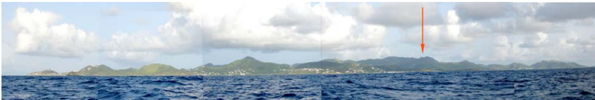
St Marten from the direction of St Barths from approximately 4.5km offshore. The arrow indicates the position of the approach mark off Oyster Pond.