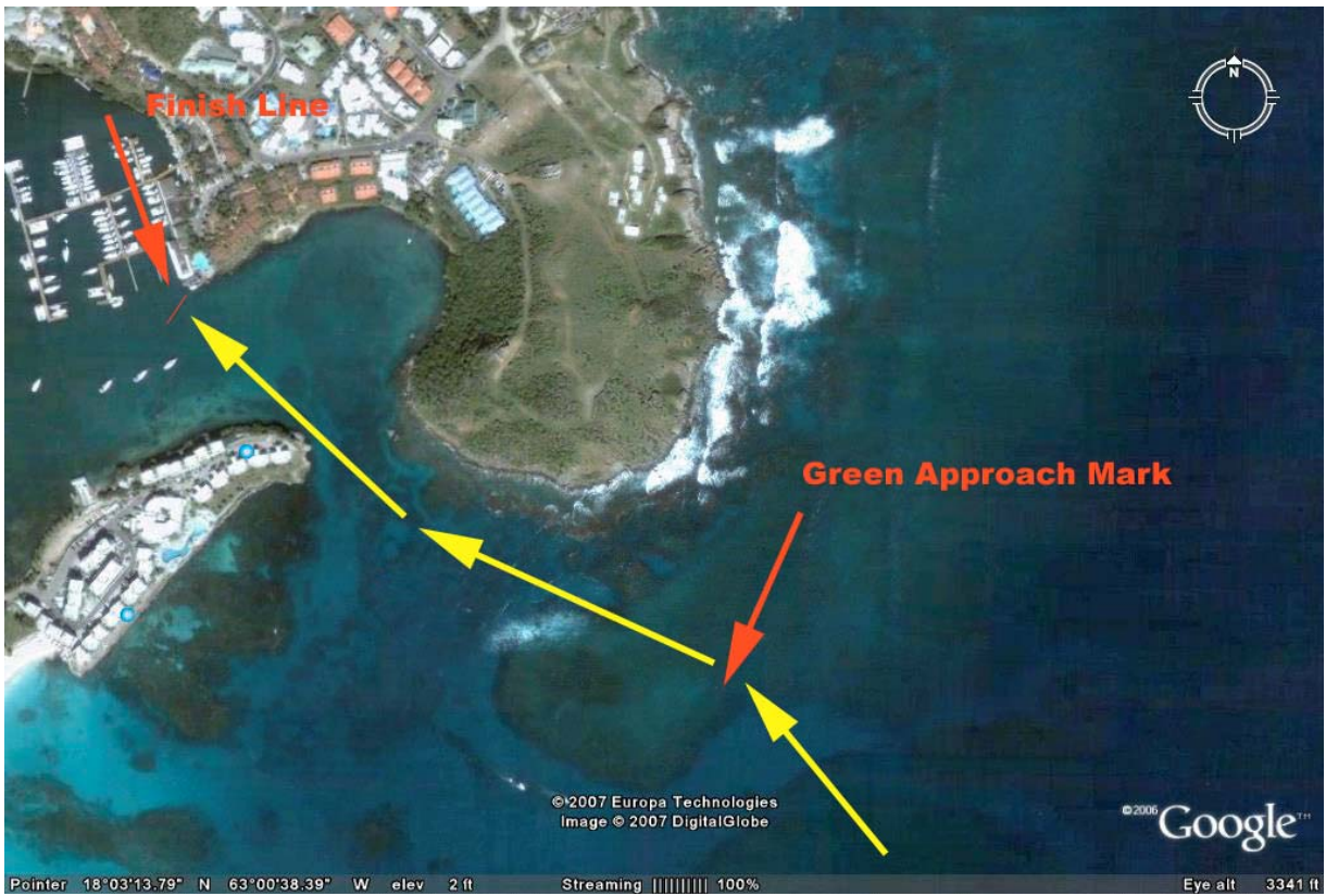
The approach to Oyster Pond and the finish Line in St Maarten.