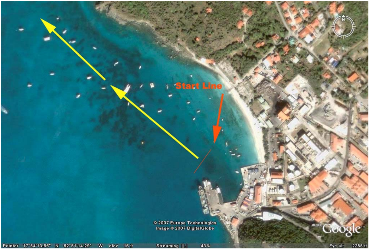
The start off Public Beach, St Barths.