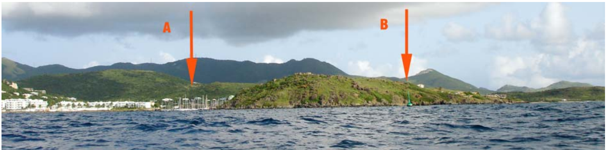
A indicates the mouth of Oyster Pond and B the green approach mark.