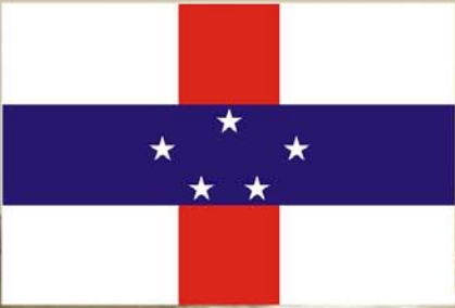
NETHERLANDS ANTILLES CANOE FEDERATION